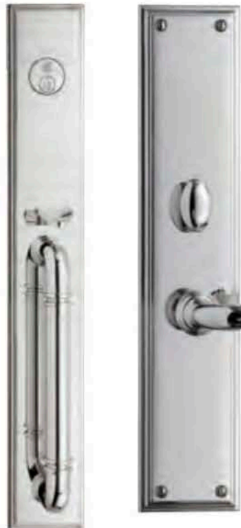
Hutter Entrance Handle Set by Classic Brass, Brassworks Fine Home Details, Providence and Boston, finehomedetails.com