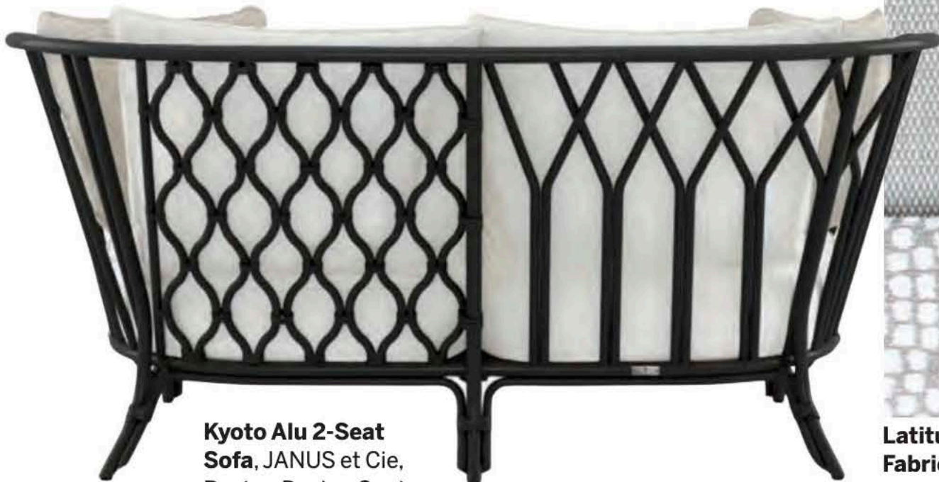
Kyoto Alu 2-Seat Sofa , JANUS et Cie, Boston Design Center, janusetcie.com