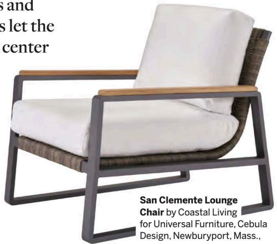
San Clemente Lounge Chair by Coastal Living for Universal Furniture, Cebula Design, Newburyport, Mass., cebuladesign.com