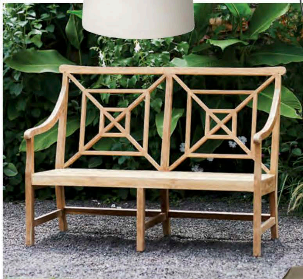
Garden Teak Fretwork Two-Seat Bench , Terrain, Westport, Conn., shopterrain.com