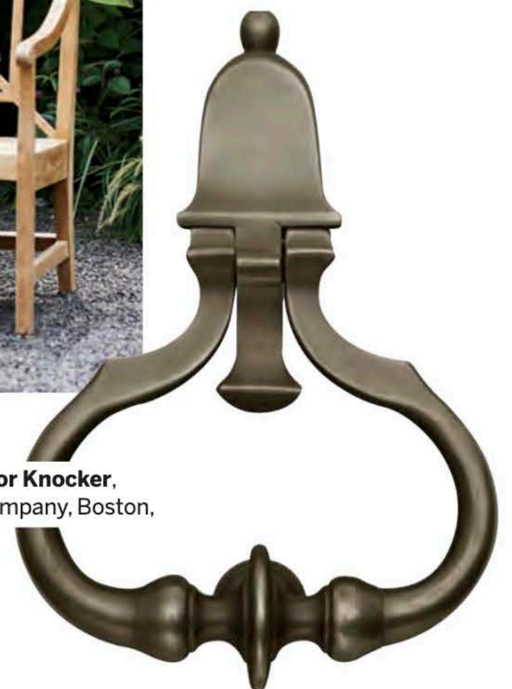
No. 9715 Door Knocker , The Nanz Company, Boston, nanz.com