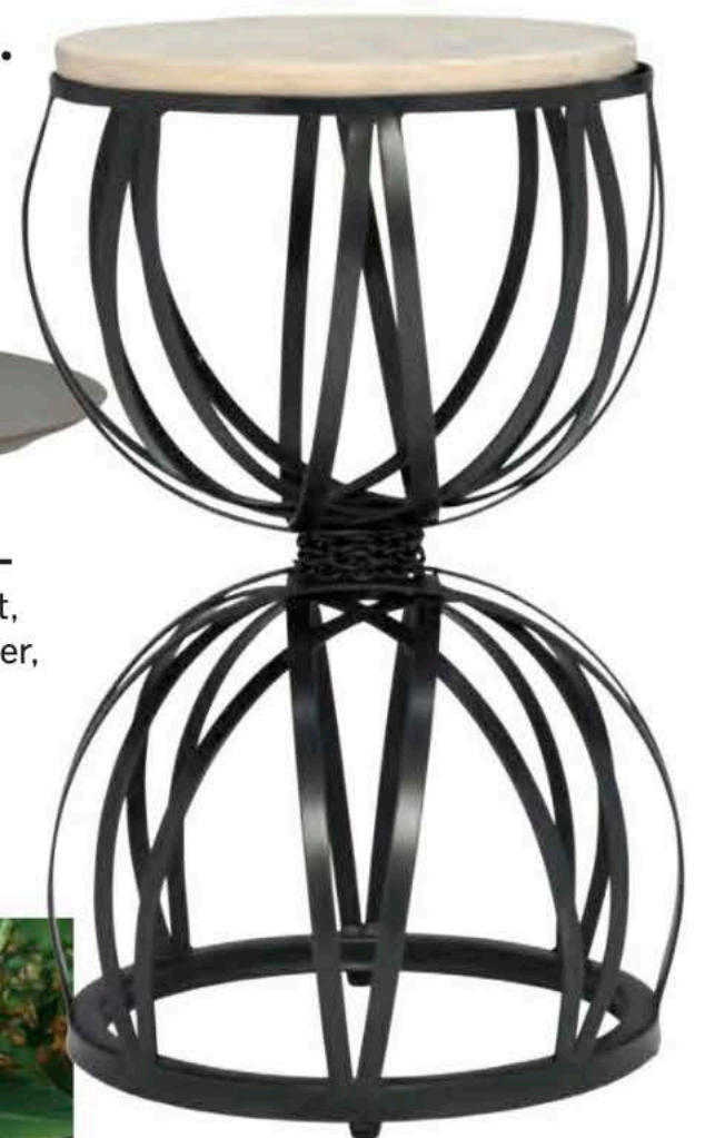
Amalfi Stone-Top Hourglass Side Table , JANUS et Cie, Boston Design Center, janusetcie.com