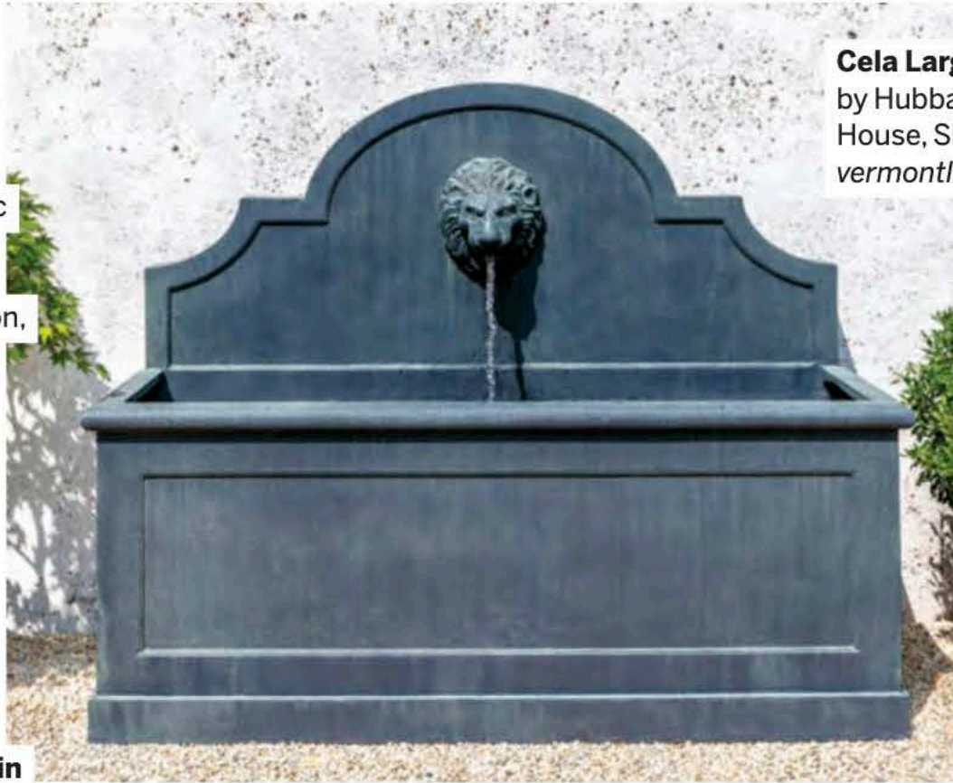
Portofino Fountain by Campania, Mahoney's, various Mass. locations, mahoneysgarden.com