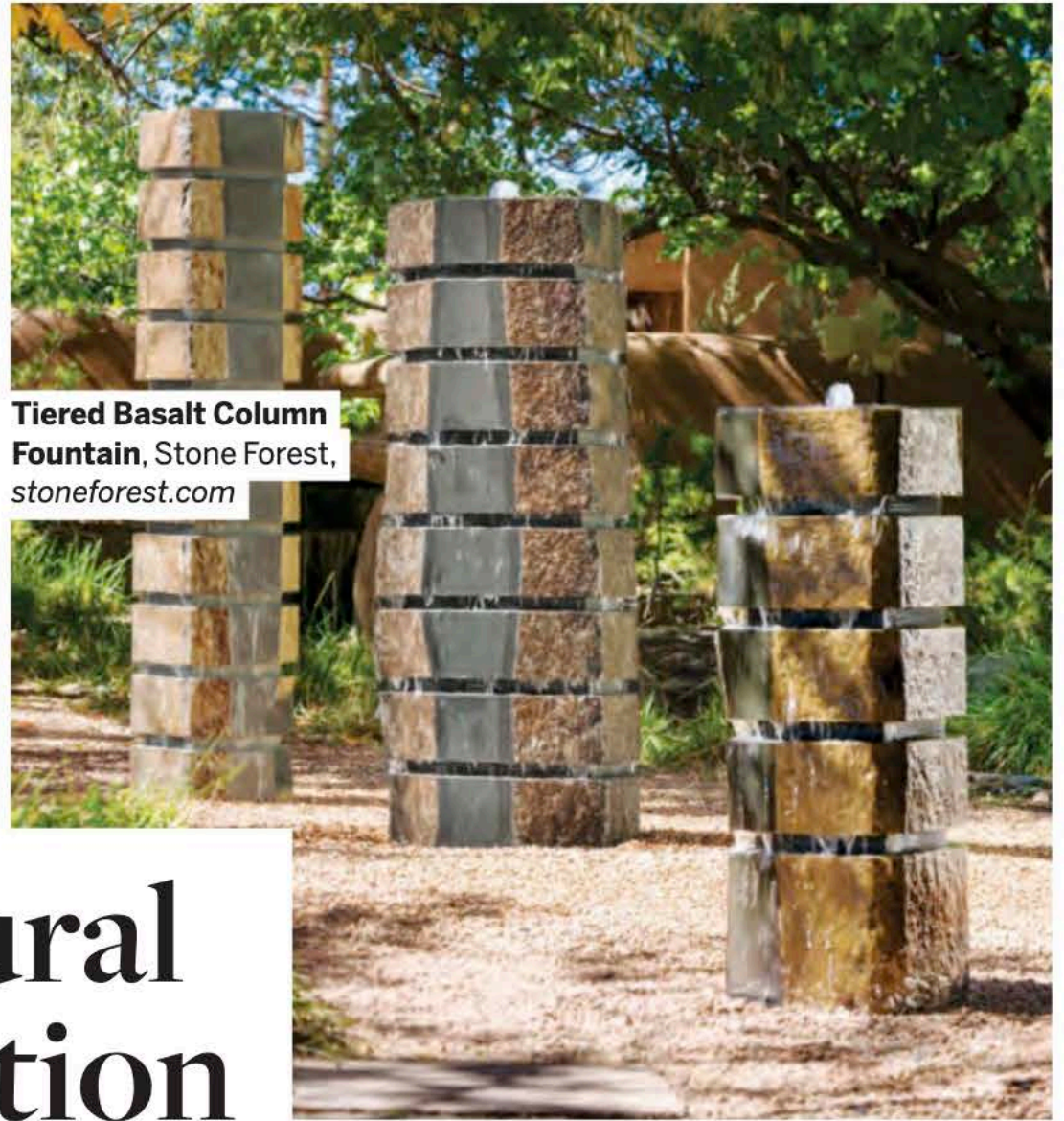
Tiered Basalt Column Fountain , Stone Forest, stoneforest.com