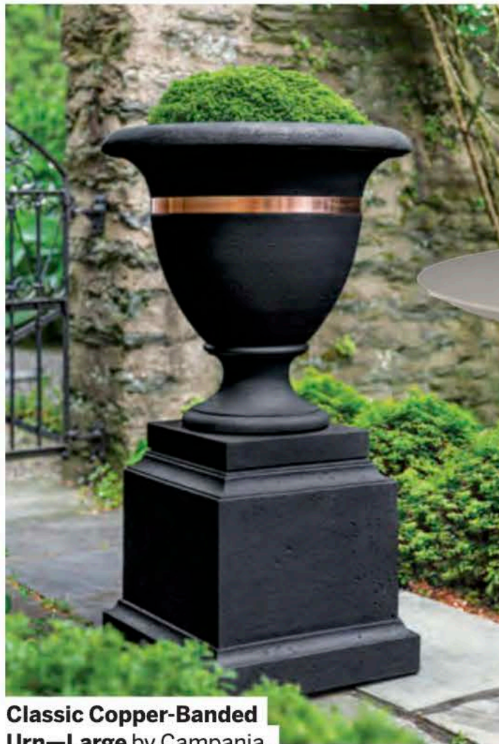
Classic Copper-Banded Urn—Large by Campania, Snug Harbor Farm, Kennebunk, Maine, snugharborfarm.com