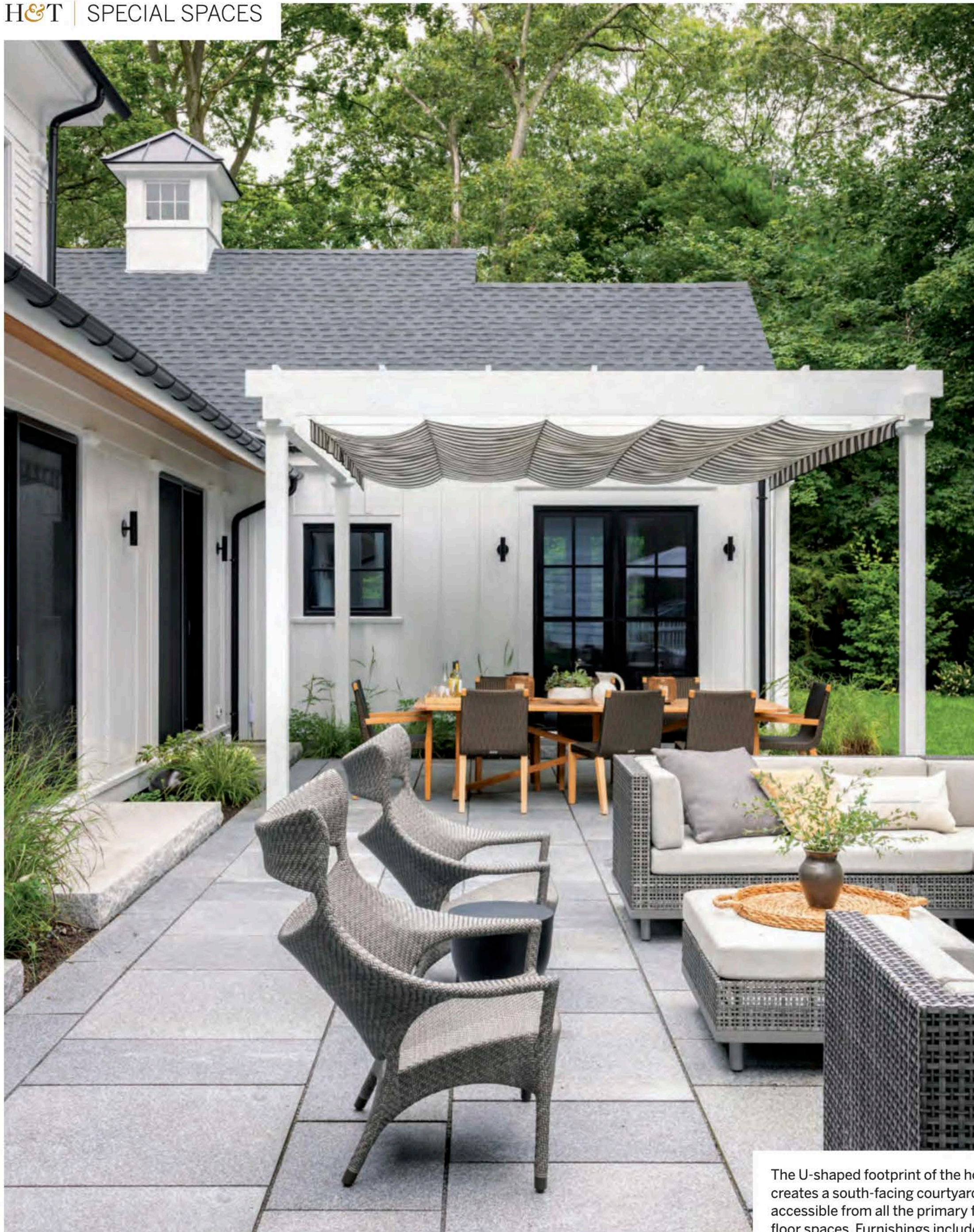
The U-shaped footprint of the house creates a south-facing courtyard accessible from all the primary first-floor spaces. Furnishings include whimsical Adirondack-style chairs, casual sofas, and a teak dining table and chairs, all from JANUS et Cie.

but they are reduced in savings over time,” he says. “We have an opportunity to educate people why these practices are good for the environment and for the people living in the house.”