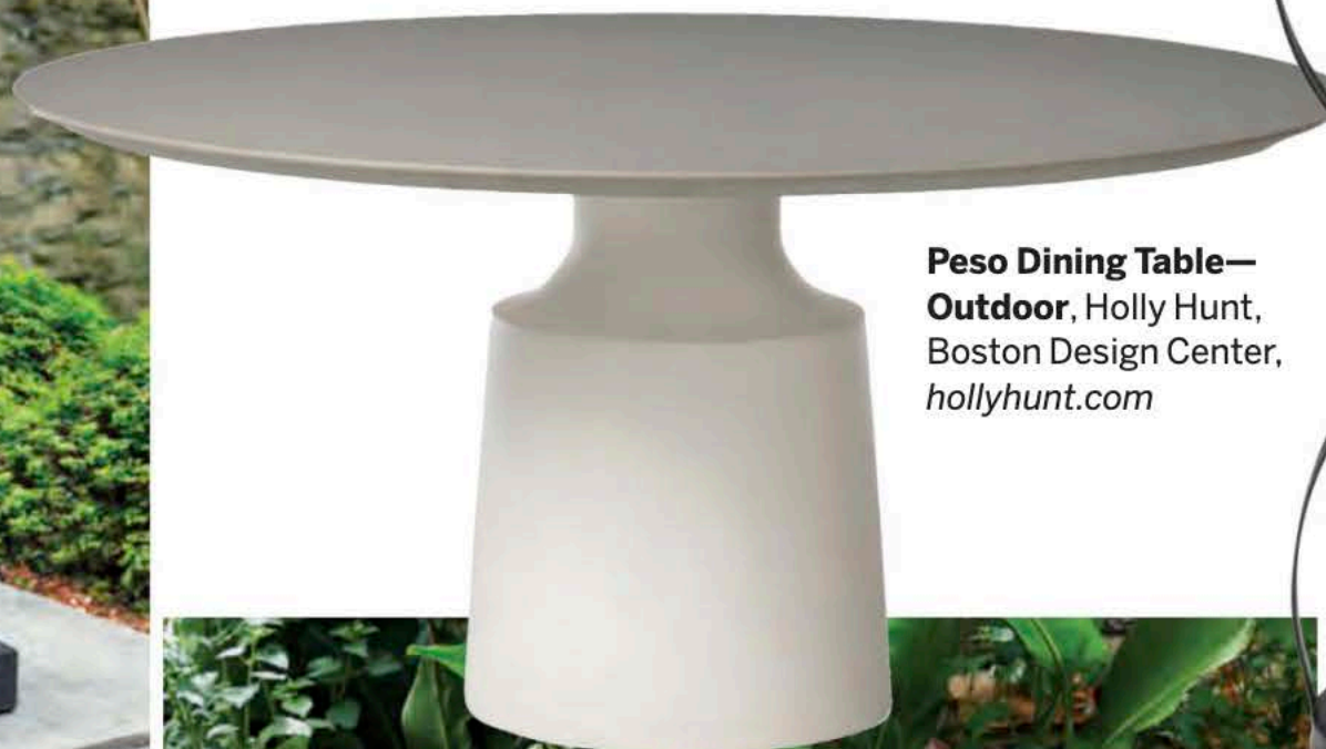
Peso Dining Table—Outdoor , Holly Hunt, Boston Design Center, hollyhunt.com