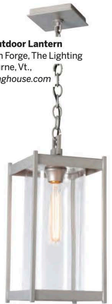
Cela Large Outdoor Lantern by Hubbardton Forge, The Lighting House, Shelburne, Vt., vermontlightinghouse.com