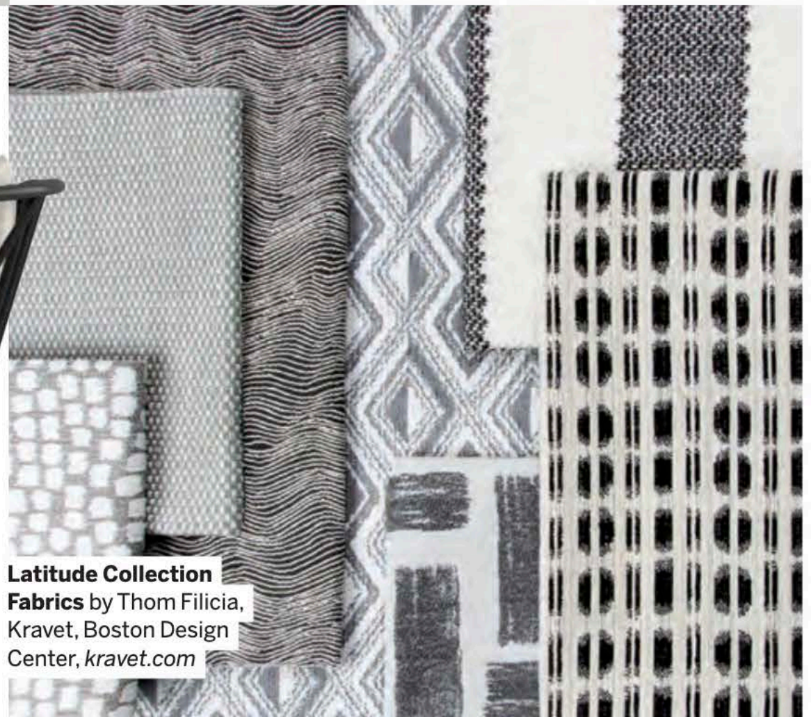
Latitude Collection Fabrics by Thom Filicia, Kravet, Boston Design Center, kravet.com