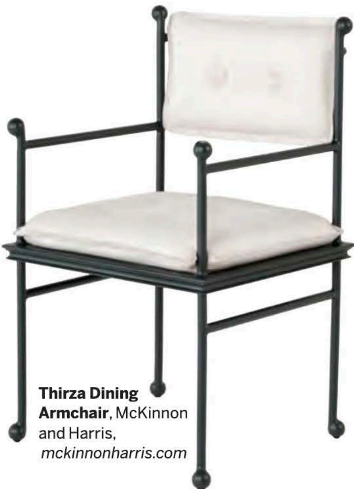
Thirza Dining Armchair , McKinnon and Harris, mckinnonharris.com