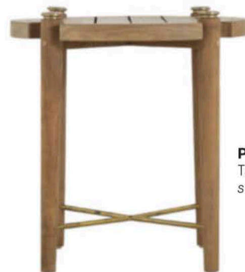
Pacifica Side Table, $764. summerclassics.com