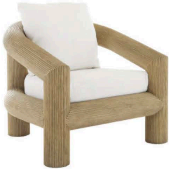
Easley Outdoor Chair in Beluga and Honey stain, $6,500. arteriorshome.com