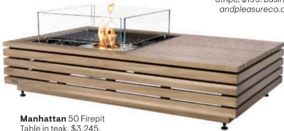
Manhattan 50 Firepit Table in teak, $3,245. ecosmartfire.com