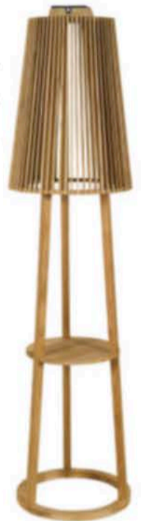
Palma LED Outdoor Floor Lamp by Les Jardins, $791. lumens.com