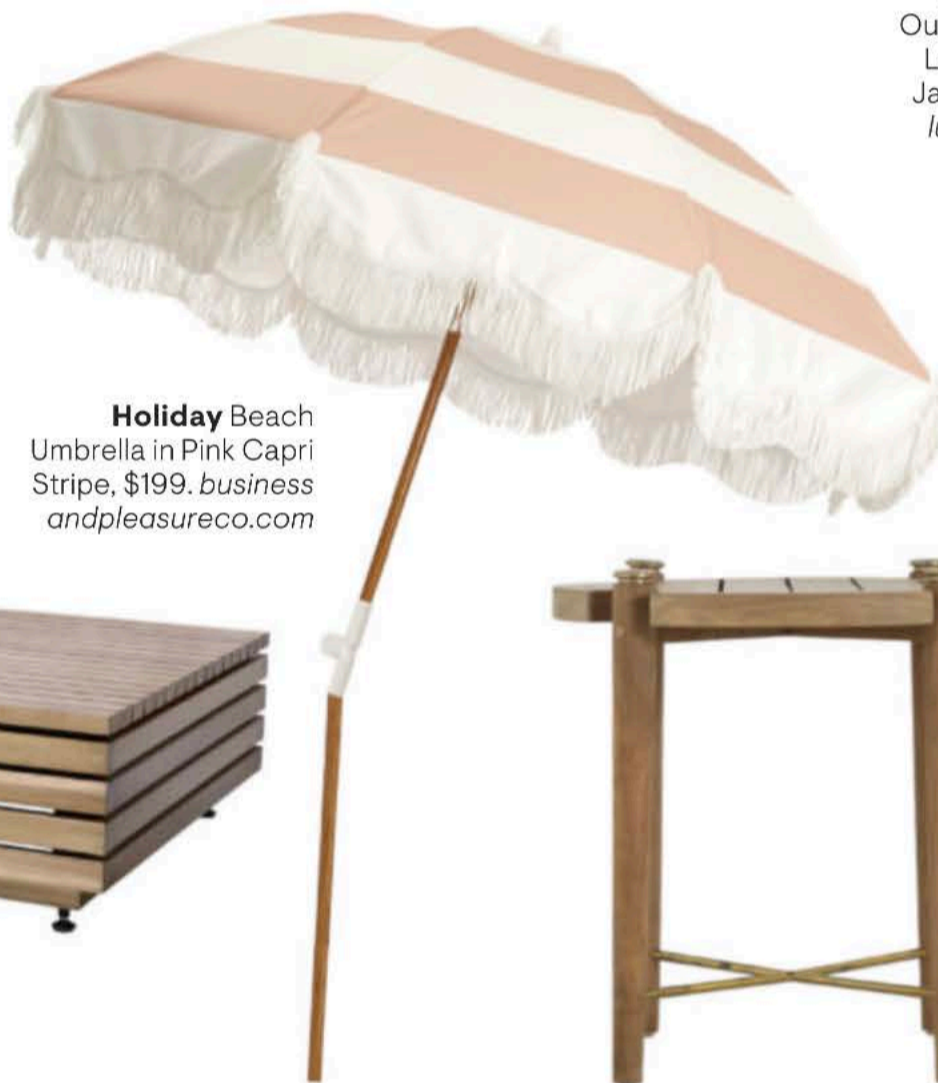
Holiday Beach Umbrella in Pink Capri Stripe, $199. businessandpleasureco.com