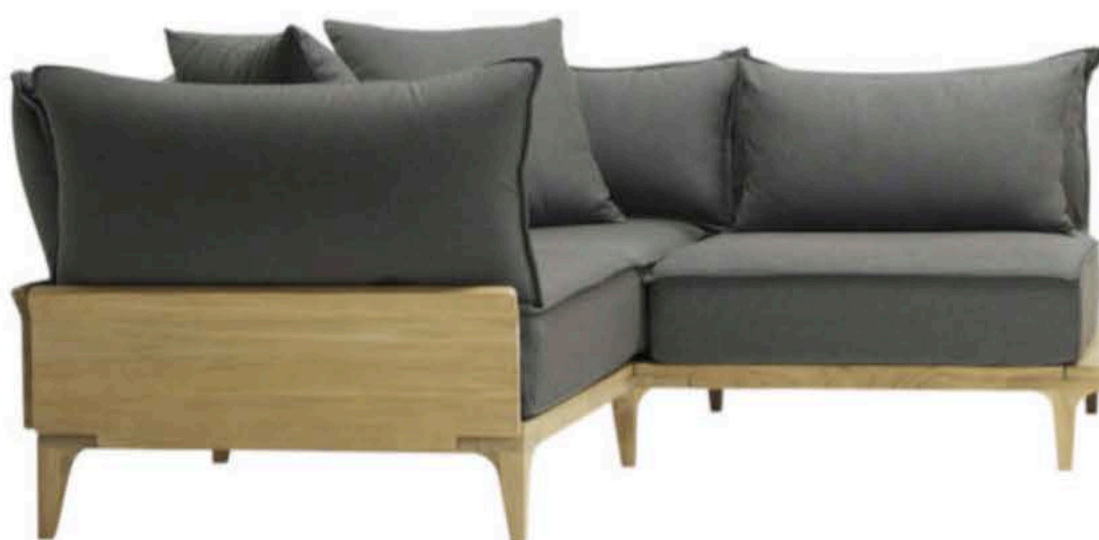
Bluff Four-piece Sectional with In-line Table in Sunbrella graphite, $10,460. hineighbor.com