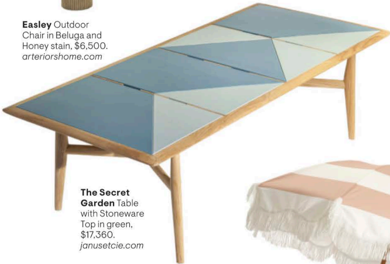
The Secret Garden Table with Stoneware Top in green, $17,360. janusetcie.com