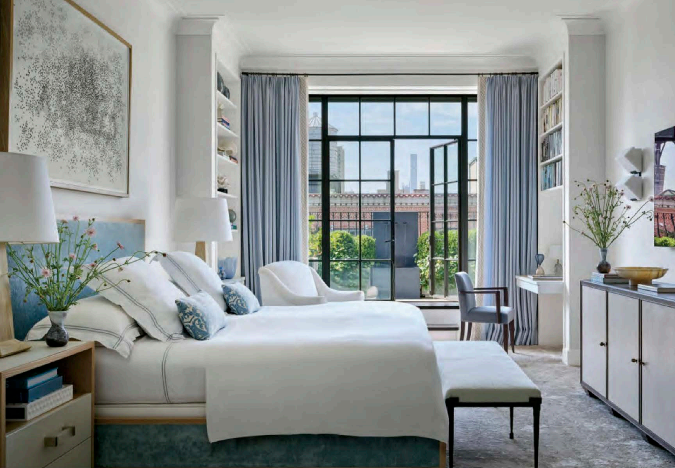
Serene Retreats (LEFT) The primary bedroom's curtains feature a Romo fabric; the bed covering is from ALT For Living. (BELOW) A stylish bathroom sanctuary. (OPPOSITE) On the terrace, outdoor furnishings are by Janus et Cie. See Resources.